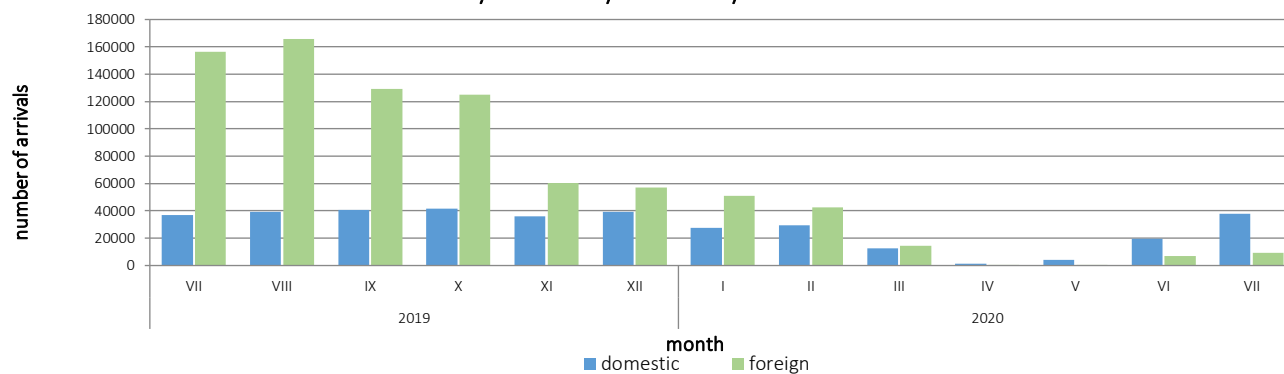
Tourist arrivals by months July 2019. - July 2020.