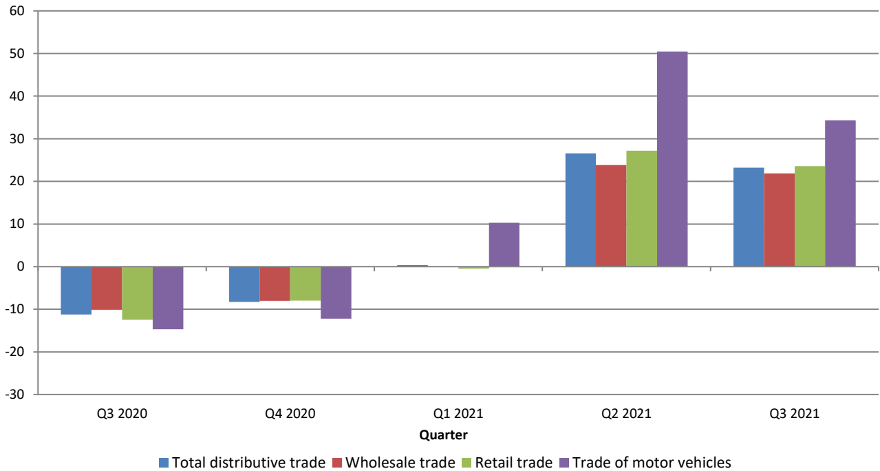
Annual growth rates in Distributive Trade, working day adjusted series

In the structure of total trade turnover (gross, non-adjusted data) in the third quarter of 2021, the greatest share is realized in the wholesale trade (54.9%), followed by retail trade (39.0%) and trade and maintenance of motor vehicles and motorcycles (6.1%).