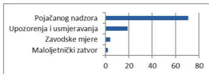
Grafikon 3. Izrečene krivične sankcije, 2017. godina Graph 3. Criminal sanctions imposed, year 2017